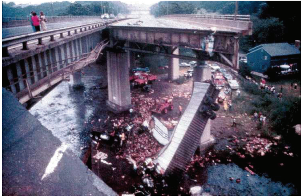
Figure 1.2.1 Mianus Bridge Failure