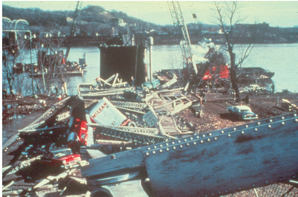
Figure 1.1.1 Collapse of the Silver Bridge

During the bridge construction boom of the 1950's and 1960's, little emphasis was placed on safety inspection and maintenance of bridges. This changed when the 681 m (2,235-foot) Silver Bridge, at Point Pleasant, West Virginia, collapsed into the Ohio River on December 15, 1967, killing 46 people (see Figure 1.1.1).